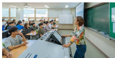
Advanced Lecture Halls/Total Lecture Halls: 473 out of 533 (89%)