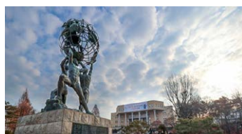
Chuncheon Campus (Area 1,001,030m 2 )