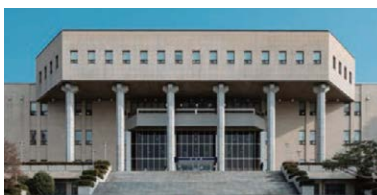
Library: 4,533 seats